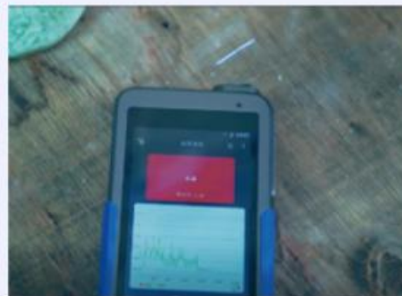
The RS1500 detects liquid and small particle (panel interface can be switched to multiple languages)